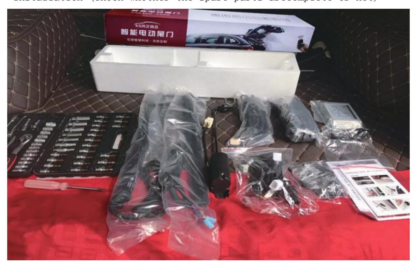
Before loading, lay a layer of cloth on the rear door to prevent scratching of the body; take out the products and installation tools

3. Safety protection measures and preparation of spare parts tools before installation (check whether the spare parts are complete or not)