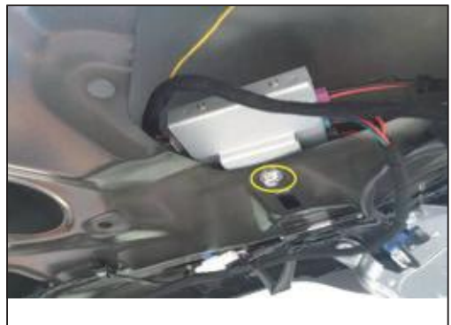
14. Installation position of control box, fixed with our screw, ring and flat washer