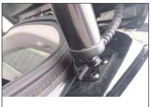
4. Remove the right lower bracket of the original vehicle, install the specially designed lower right bracket, and fix it with the specially designed round head screw (as shown in the figure).