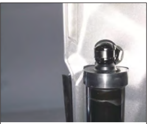
Remove the ball head of the original vehicle and install the specially designed electric pole with the specially designed ball head.