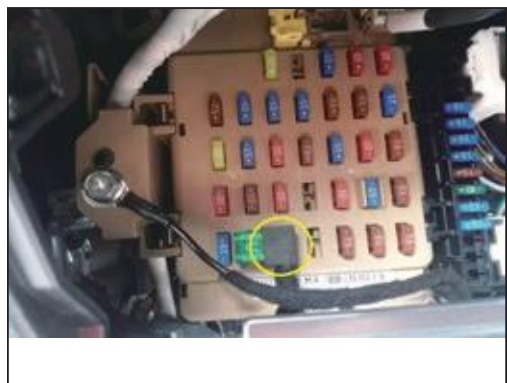
8. Remove the trim board under the main driver, pull out the 15A fuse of the original car and insert our power plug into it.