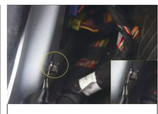
9. Main driver compartment side connection to ground wire