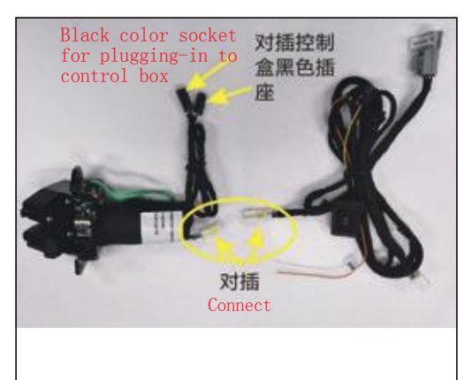
13. As shown in the figure, connect our electric suction lock socket.