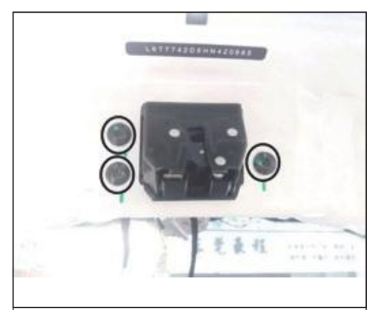
12. Remove the door lock of the original vehicle, install our electric suction lock, and fix it with the screws of the original vehicle.