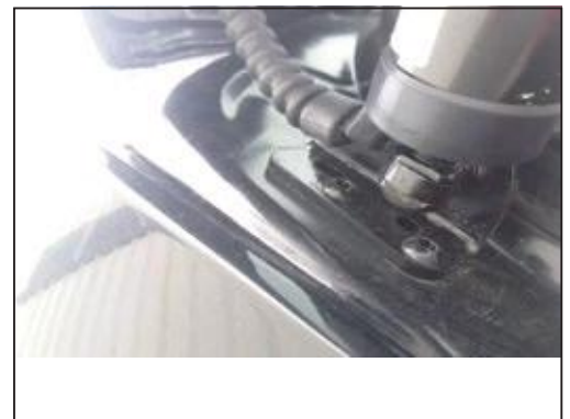
3. Remove the left lower bracket of the original vehicle, install the special left lower bracket, and fix it with the specially designed round head screw.