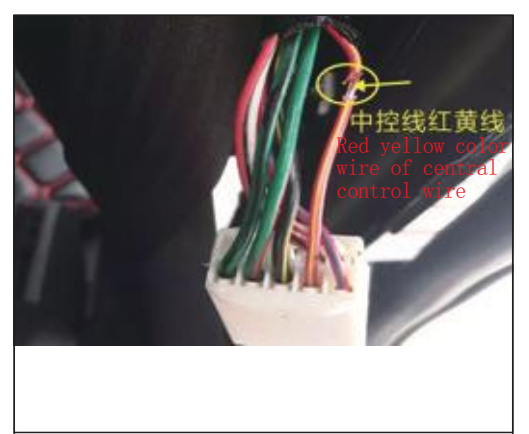
10. Remove the trim board at the B-pillar of the main driver's seat belt and find the central control. Our yellow central control wire connects the red and yellow line of the seat (the fourth hole in the first row from left to right).