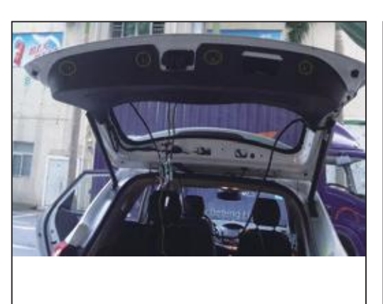
1. Remove the button and remove the trim panel