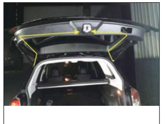
7. Hall wire to tailgate cover board control box