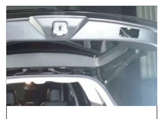
15. Remove the trim board, punch holes in the trim board and install the tailgate switch button.

After the installation is completed, you must set up the tailgate programming settings. Make sure that the doors are closed in place.