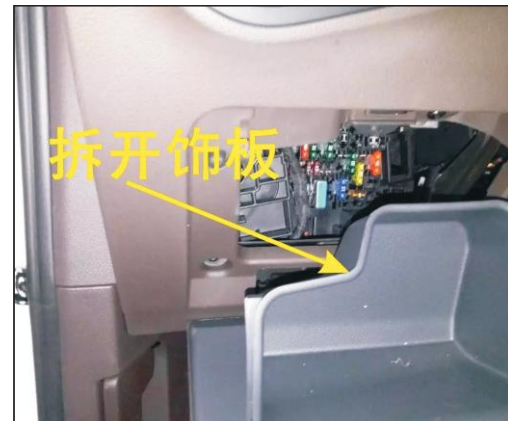
5. Remove the trim at the bottom of the main driving, find out the power