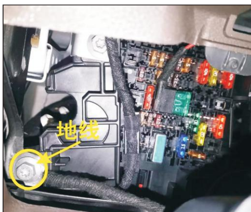
8. Connected to ground