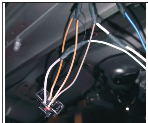
16. Unplug the seat in the car door lock, the seat of our tee adaptor