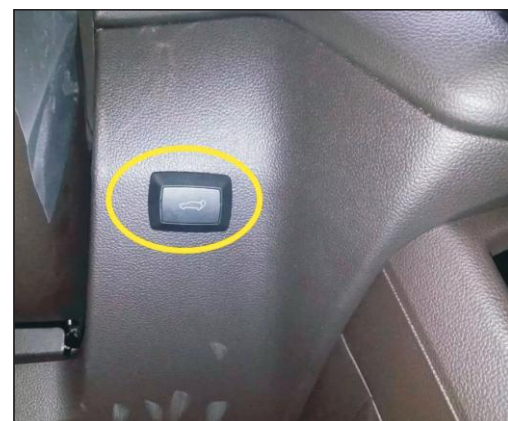
9. In the main drive side before remove the plaque stiletto installation dedicated switch