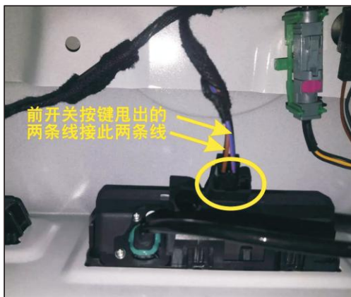
17. Back in the car door for the saddle, the main switch before driving out two lines, respectively by the seat of the two lines