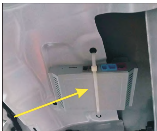
19. Installed as shown, the central control box, with our company 3 m glue and cable tie