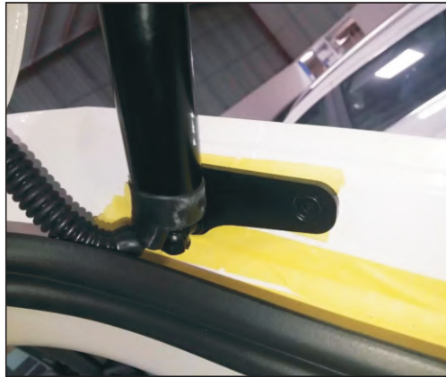
2. Remove the original car right bracket, installation we lower bracket