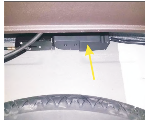
15. Motor installation position