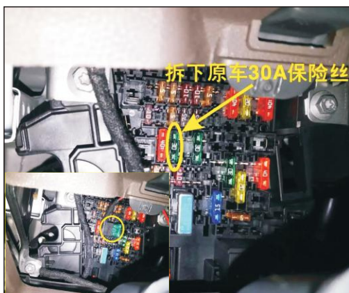
6. Remove the original car 30 a fuse plug, plug in our power plug