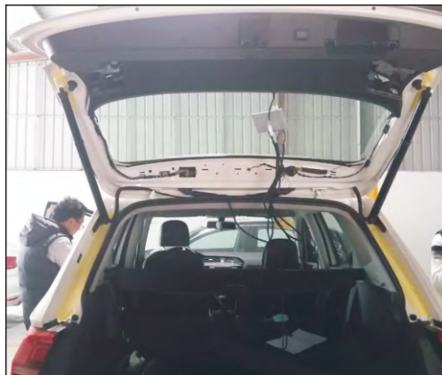
5. Strut installation is complete