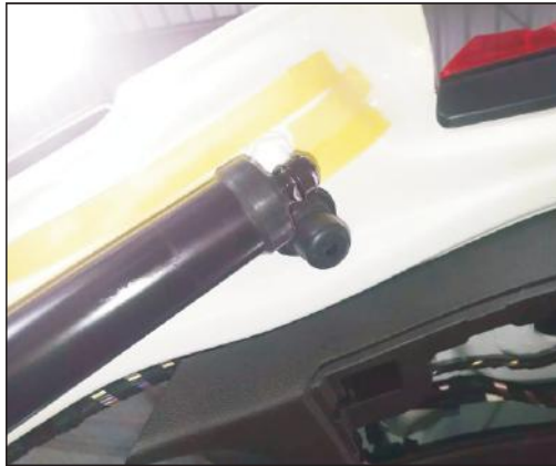
1. In the original car ball head installed our poles (or steps)

Please check regularly that all accessories connected with the car are loose to ensure safe use.