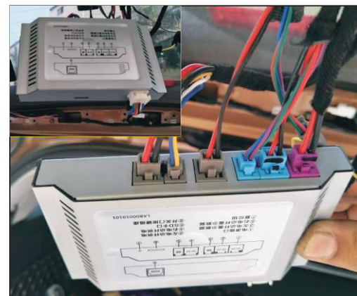
18. The hole line, power line, electric line plug according to the color of a pair of control box