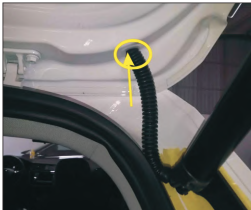
4. Hall line through from the hole