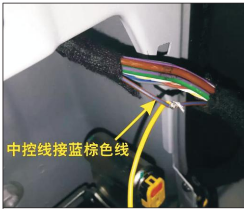
11. Our yellow lines to central pick blue and brown