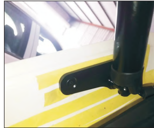
3. Remove the original car bottom bracket, installation we lower left bracket