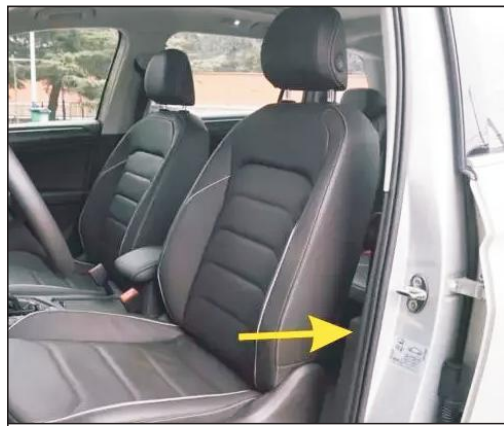
10. In the main drive belt B column trim place apart, find the control