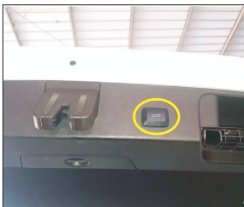
20. In the tail door trim stiletto installation we switch button