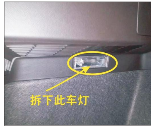
12. In the trunk of the left to find the headlights remove the lights, the original light red, brown line cut, one end of the control box out of the two yellow, and blue lines (pictured), the other end of the package with tape