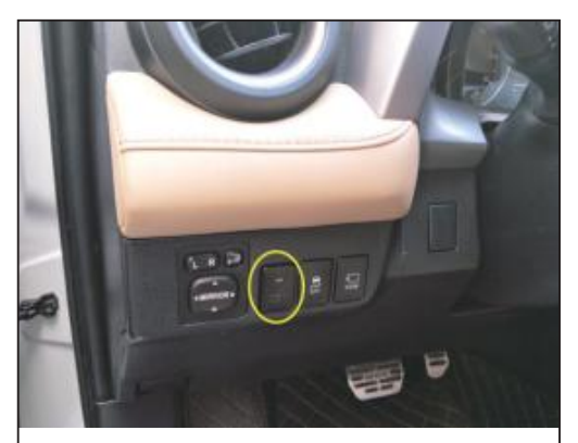
10. At driver compartment takes off the dummy button of the original car and install our front switch button.