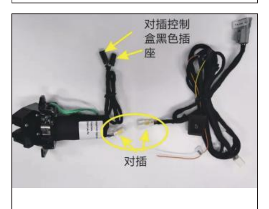
16. As shown in the figure, the socket of the three-way harness is connected to our electric suction socket.