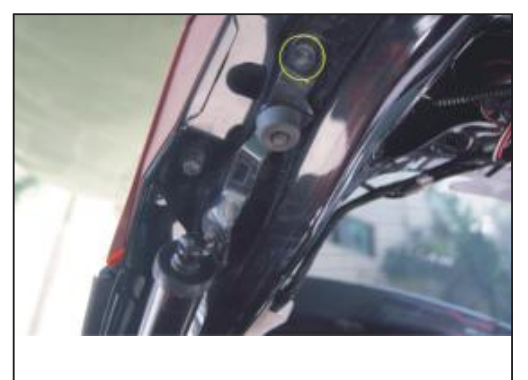
4. Install our electric pole with the upper bracket of the original car (the same steps are left and right)