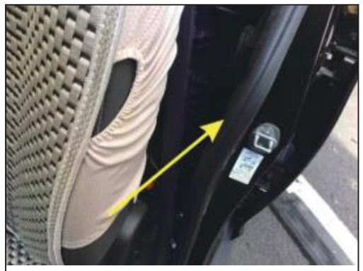
11.At the B-pillar of the driver side seat belt, remove the trim and find the central control wire.