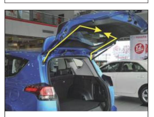
7. The Hall wire passes through the reserved hole and goes to the tailgate trim board.