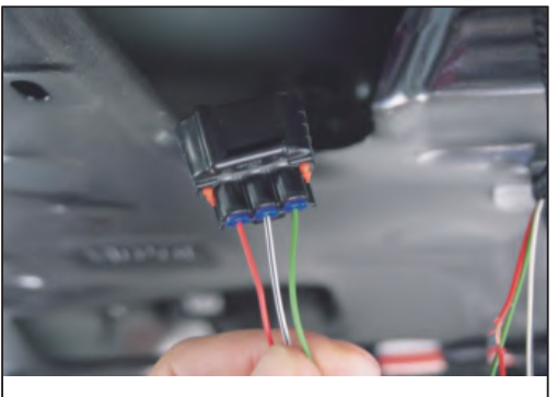
17. Connect the original car unlock plug directly with our provided three-way adapter socket, and plug the other end of our socket to the door lock socket.