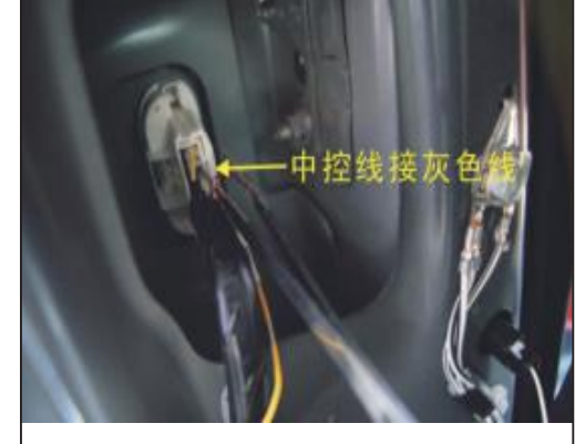
12. The central control wire is connected to grey color wire (the third hole in the second row from left to right)