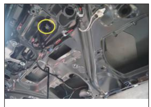
18. Unplug this socket at the tailgate and connect to our front switch socket