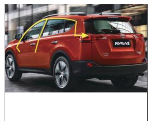
13. Power supply wire front switch wire and central control wire follow yellow color line routing