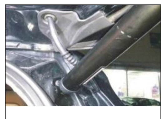
6. Plug the silicone plug into the reserved hole