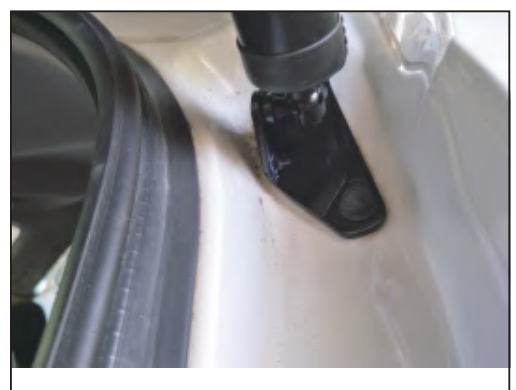
3. Remove the lower right bracket of the original car, replace with our lower right bracket of(ball head facing outward), and fix it with the original car screw.