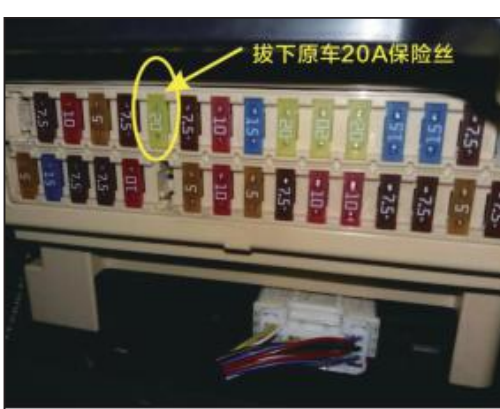
8. Remove the trim board under the driver compartment, pull out the 20A fuse of the original car, and insert our power plug.