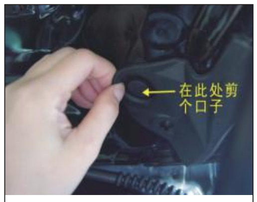
5. Remove the rubber stopper and cut a hole to facilitate Hall wire threading (the same steps on both sides)