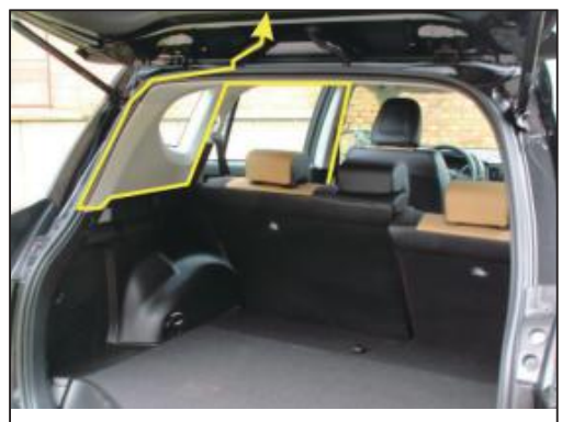
14. The power cable, front switch wire and central control wire pass through the rubber stopper until they reach the central control box.