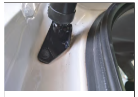
2. Remove the lower left bracket of the original car, replace with our lower left bracket (ball head facing outward), and fix it with the original car screw.