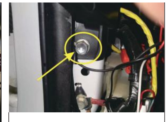
9.Remove the trim board at the side of the driver compartment, loosen the screw and connect the ground wire then tighten the screw.