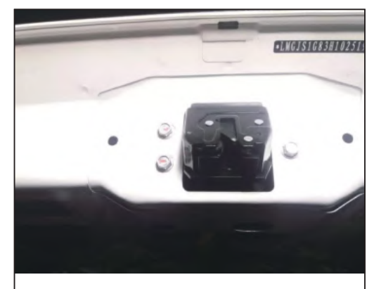
15.Remove the screw of the original car, remove the suction lock of the original car, install our electric suction lock, and fix it with the screw of the original car.