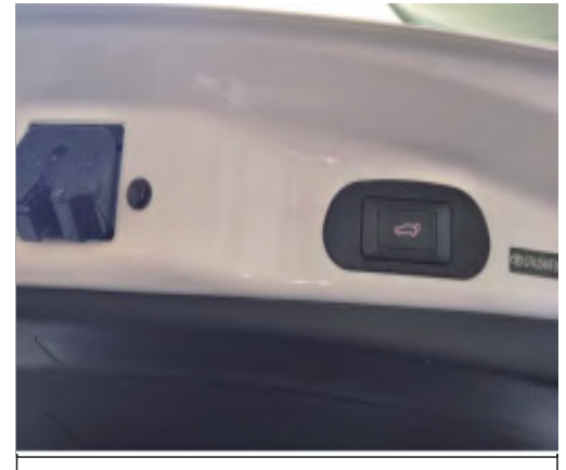
21. Install the tailgate switch at the position shown in the figure

After the installation is completed, you must set up the tailgate programming settings. Make sure that the doors are closed in place.