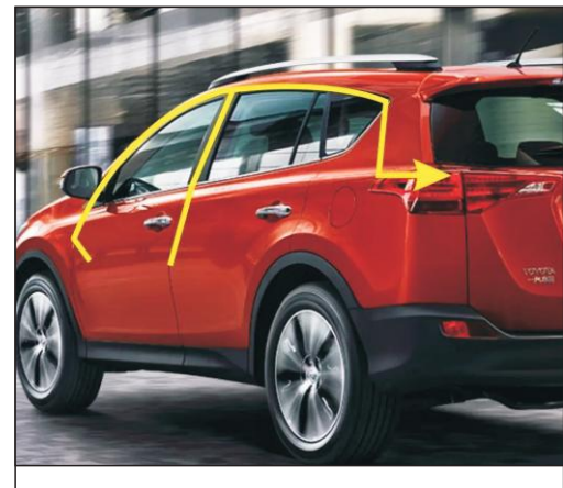
12. And the power cord, switch before lines to central walked along the yellow line