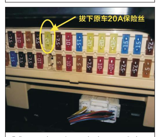
7. Remove the trim at the bottom of the main drive, remove the original car 20 a fuse, plug in our power plug