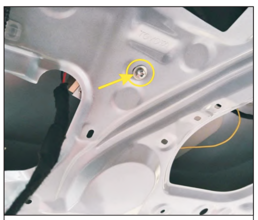
14. Install the control box, here with our 3 m glue on the back of the control box, with a tie \,