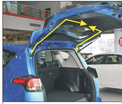
6. Hall walk line after line through the hole to end door cover plate