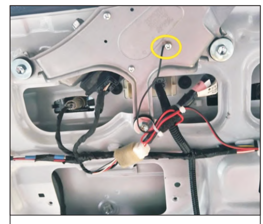
15.\,\mathrm{Switch} before the black line connect the tail door grounding screw