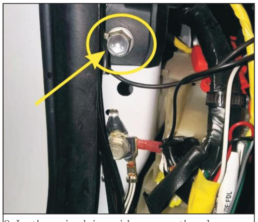
8. In the main drive side remove the plaque, loosen screw after connecting the ground wire, tighten the screw