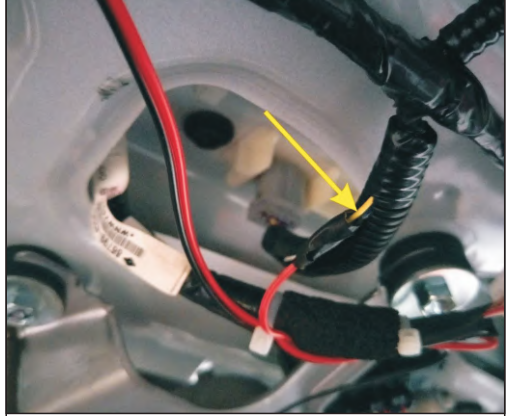
14.\,\mathrm{The} main switch before driving red line after the saddle yellow line