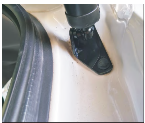
3. The original car right bracket will be removed, replaced our lower bracket (ball head outwards), with the original screw fixation