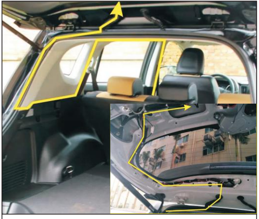
13. And the power cord, switch before the Central Line through the rubber plug walked to the central control box