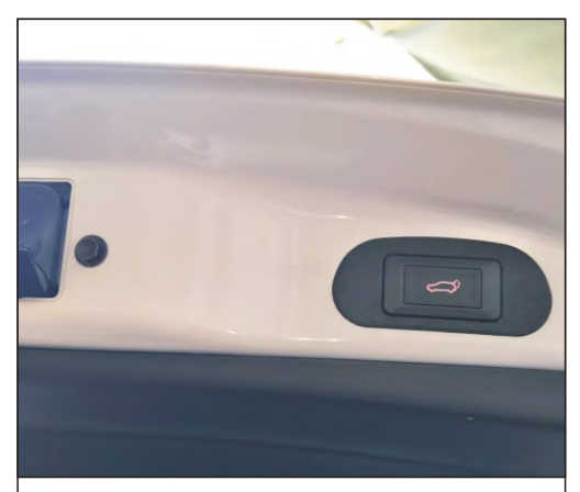
15. \, \mathrm{Install} the tail door switch to the position as shown