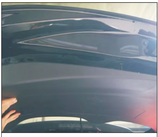
1. Black plate will be removed in the first place

Please check regularly that all accessories connected with the car are loose to ensure safe use.