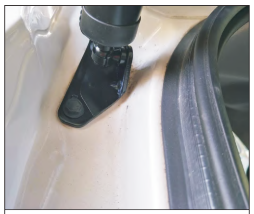
2. The original car bottom bracket will be removed replace our bottom bracket (ball head outwards), with the original screw fixation