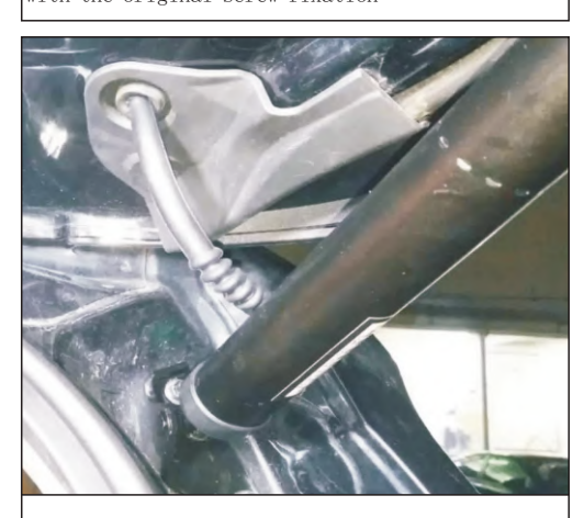
5. Will the silicone "into the hole