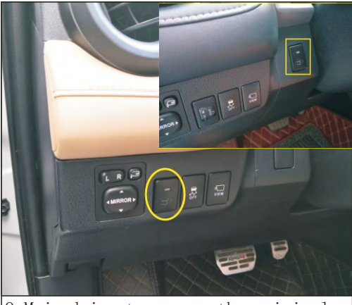
9. Main drive to remove the original empty button, the installation before we switch button (choose one)