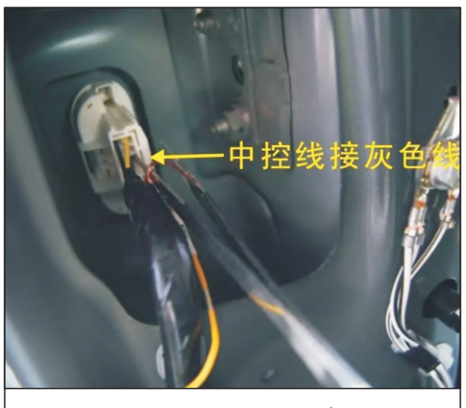
11.Central Line by gray line (from left to right the second ranked the third hole)