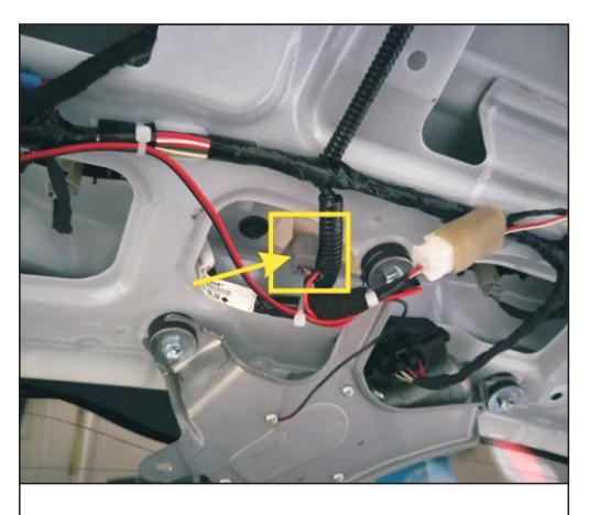
13. Under the stern door pull the seat