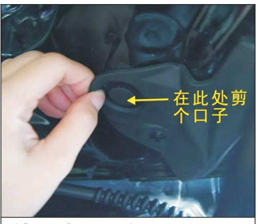
4. Remove the stopper is cut open a vent, conducive to hall wire threading (left and right side steps)