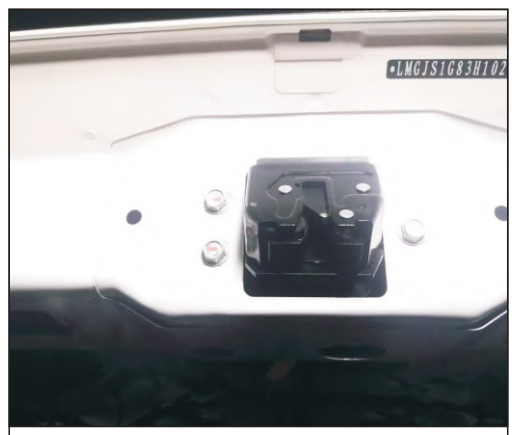
14. Abort the original screw, remove the original car lock, installed on our electric absorption, use the original car screws