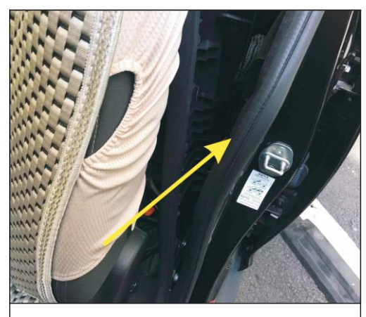
10. In the main drive belt B column, trim will be removed, and find the Central Line